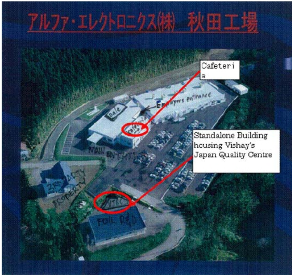
Drawing of the Leased Space